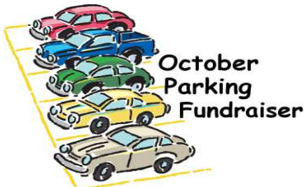
October Parking Fundraiser

Thank you to all those who signed up for copies of our history. It was a help in making a decision about the number of books to print. Printing cost are high and we do not want to print more than we need, nor do we want to run short of copies for those interested.